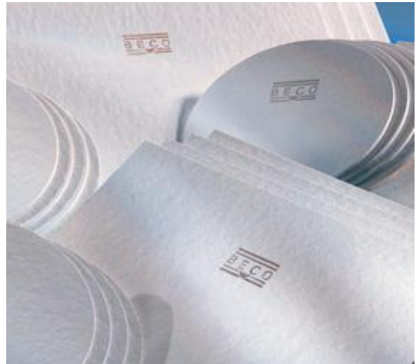
Water throughput BECO standard range

BECO KD 3, K 2, K 1 BECO depth filter sheets with large-volume cavity structure. These depth filter sheets have a high holding capacity for particles and are especially suitable for clarifying filtration applications.